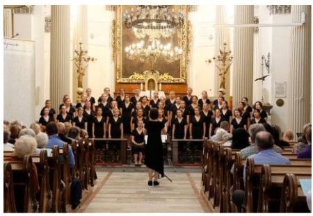
Amore Tour to Poland & the Czech Republic 2019

from many different backgrounds and cultures, including other choirs and singers, homestay families, and people in the community. They gain confidence and independence through the challenges and responsibilities of traveling as a group—ordering a meal in another language, sharing a hotel or dorm room with other choristers, and touring an area independently in small groups. Many Northwest Girlchoir graduates speak of choir tours as some of the most memorable and transformative experiences of their choir careers.